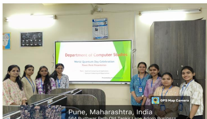
Pune, Maharashtra, India 564 Budhwar Peth Old Tankir Lane Adorn Business